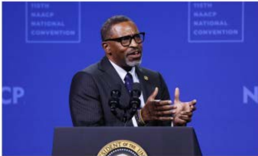
NAACP President and CEO Derrick Johnson speaks at the 115th NAACP National Convention at the Mandalay Bay Convention Center on July 16, 2024 in Las Vegas, Nevada.

Click here to read the entire NAACP Resolution to Support Every Child Reading by the First Grade, Mastery by the Third Grade